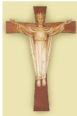
The Exaltation of the Holy Cross