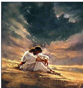
Today's Gospel: The temptation of Jesus in the wilderness.