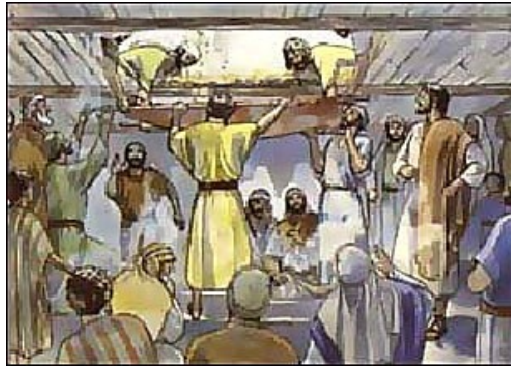
Today's Gospel: Jesus cures and forgives the man lowered through the roof.