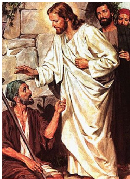
Today's Gospel: Jesus heals the leper.

What is your teenager thinking? Care for the Family, a charity supporting and encouraging families in the UK, is having a presentation on Tuesday 3 March from 7:30 to 10:00pm at the All Nations Centre, Frog Island. For more information, see the noticeboard and take a handbill.