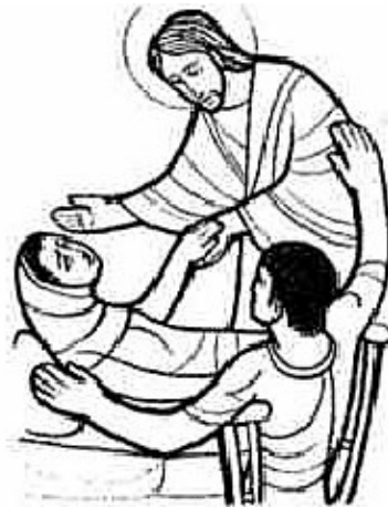
Today's Gospel: Jesus heals the sick.

We would like to collect the memories of the church and priory, especially before these memories are lost! Many of you remember what the church and priory were like before the church was extended in 1953. Having said that, the project is to get glimpses of various eras and epochs in our history. If you have memories of coming to Mass here, what it looked like, and if you have photographs or pictures of this priory and church, or other memorabilia such as service sheets or newsletters - or remember things you were told as a child about the OLD Holy Cross or St Michael's - please do let us have these.