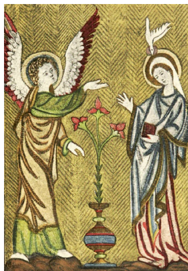
Today's Gospel: The Annunciation