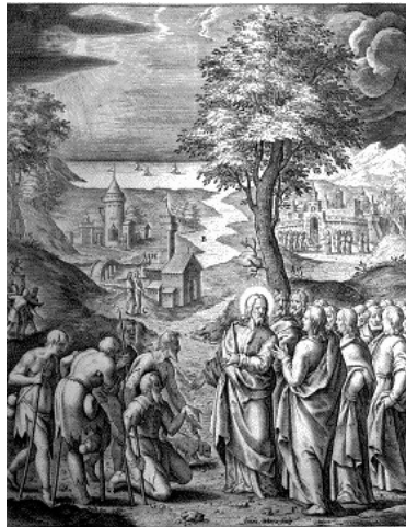
Today's Gospel: "But you, who do you say that I am?"

Enrich your marriage. If you are a married couple, here is an opportunity to enrich your relationship away from the stresses of everyday life. A Marriage Encounter Weekend is for couples who have stable marriages and gives them time to look at their relationship. The weekend is spent listening to a series of presentations on various aspects of relationship, including the Church's Vision for Marriage. Apart from mealtimes and the concluding Mass, the weekend is spent together as a couple. The next weekend in this region is at Chesterfield from 19-21 September. Visit the website www.wvme.org.uk or ring 0115 877 7694 for details, and see the noticeboard.