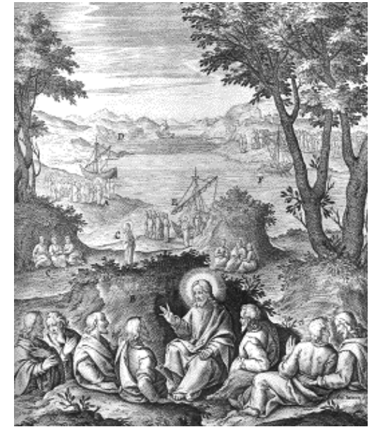
Today's Gospel: The feeding of the five thousand

Ride & Stride. This year's sponsored ride and walk, visiting the churches of Leicestershire, will take place on Saturday 13 September. Please make a note in your diary now! Sponsorship forms will be available nearer the time.