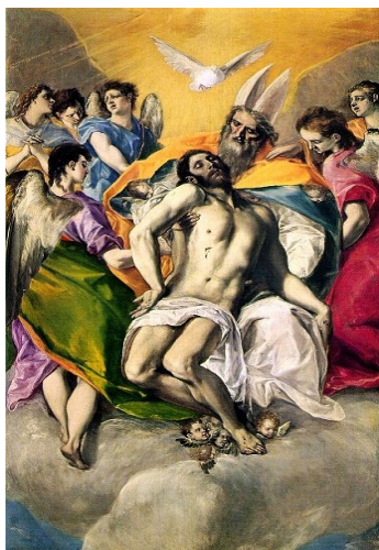
The Most Holy Trinity