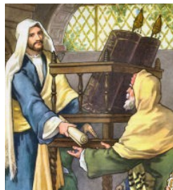
Today's Gospel: Jesus teaches in the synagogue.