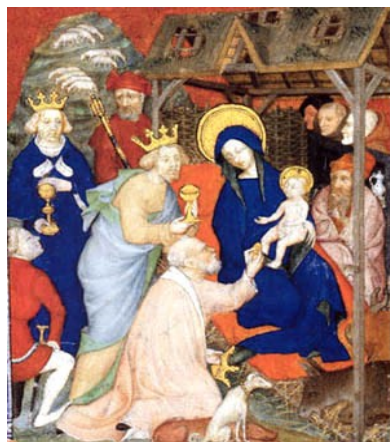
“They offered Him gifts of gold, frankincense and myrrh...”